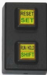
Switch Box Controller