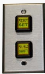
Wall Plate Controller